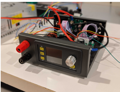
Figure 3: RD DPS5015 power supply, opened [7]

We used SHIMWARE to retrofit an RD DPS5015 [7] lab power supply unit (Figure 3).